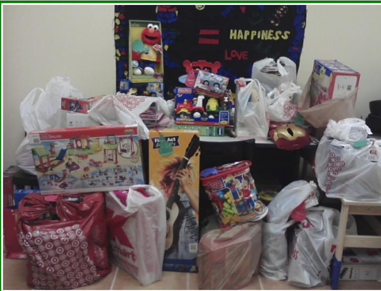
Fruits of the Angel Tree drive

Thank you to all who gave generously to the Angel Tree drive benefiting underprivileged children through the “Adopt A Wish” program of ChildNet. We had 100% participation this year which meant that every child had their holiday wishes come true because of you.